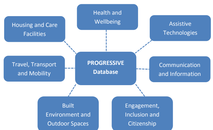
Categories included in the PROGRESSIVE standards database